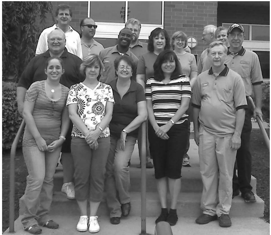
Elmhurst Management Team at Greater Pgh Community Food Bank

Because of the generosity of our tenants, more than 2,000 pounds of food were delivered to the Pittsburgh Community Food Bank today! The canned goods, cereal, pasta and other non-perishables will be put to good use in our local communities. Elmhurst is proud to have partners like you, people who recognize the tough situations faced by many in our community, particularly in the midst of the current recession, and stepped up to help.